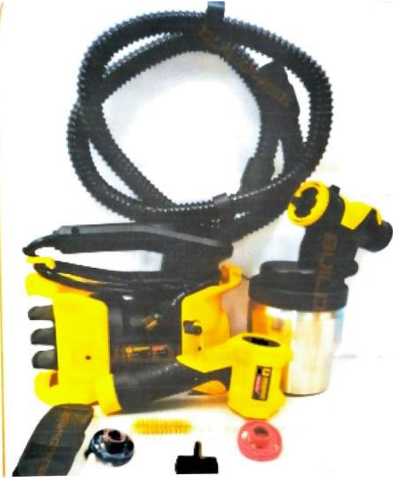
Electric Paint Sprayer

Input Power 600W Water Flow Rate: 1000ML/Min Standard Nozzle Size: 2.5MM Rated Voltage: 220V Rated Frequency: 60Hz